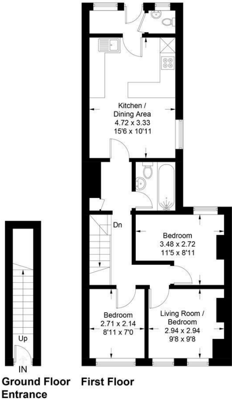
Illustration for identification purposes only, measurements are approximate, not to scale. Fourlabs.co © (ID1258099)

Approximate Gross Internal Area = 60.3 sq m / 649 sq ft